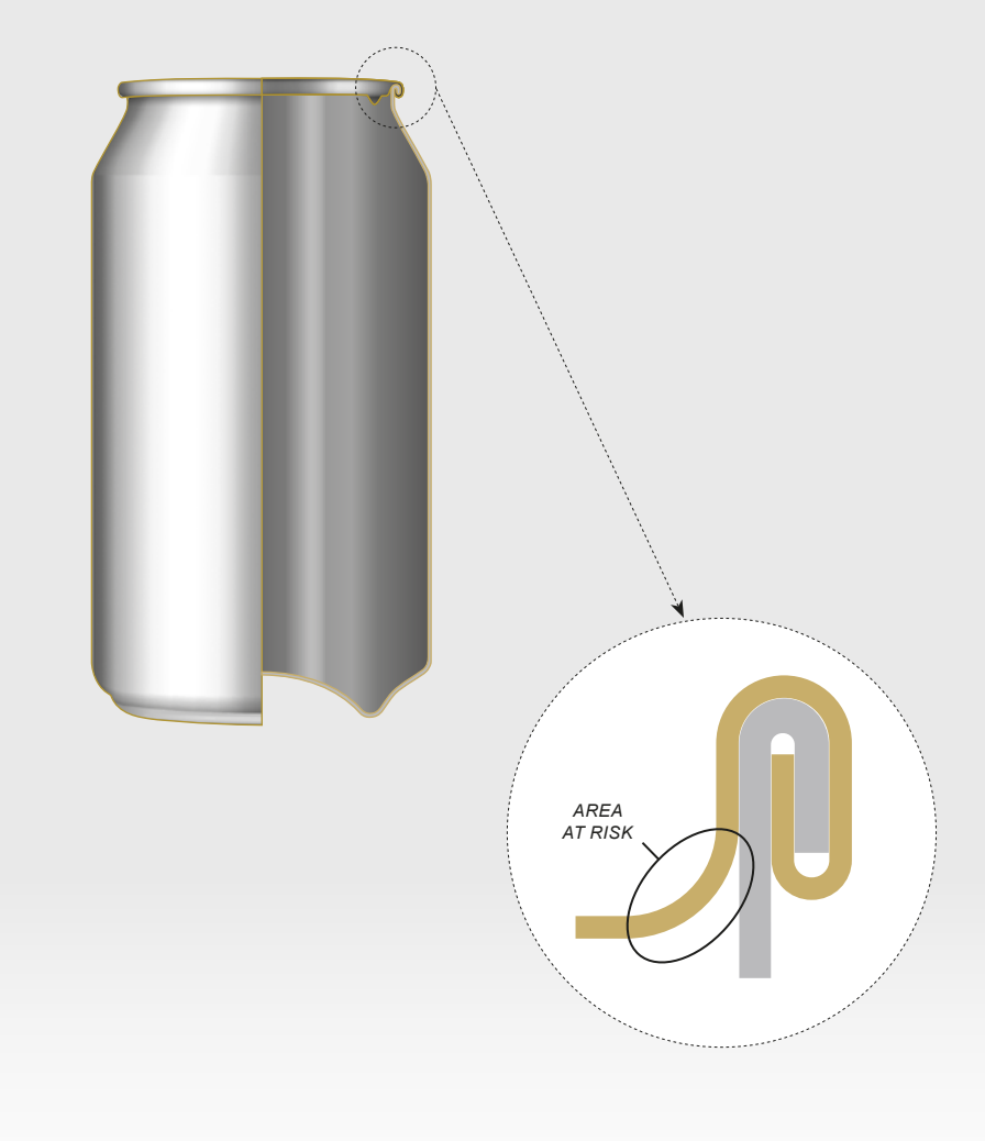
Figure 3. Cross-section of the double seam connecting the body and the can end.

Determining the exact cause of coating failure in a unique situation is a difficult task.