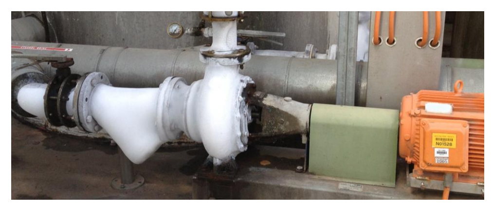
Figure 2. Ice forming on a short section of the system that is not insulated

Prevent condensation: When water condenses and freezes on brine distribution pipes and tank jackets (Figure 2), considerable heat is transferred to the brine. Insulation can prevent this process and save energy. Insulation of the refrigeration plant as well as the brine reticulation system and wine tanks saves energy use and greenhouse gas emissions.