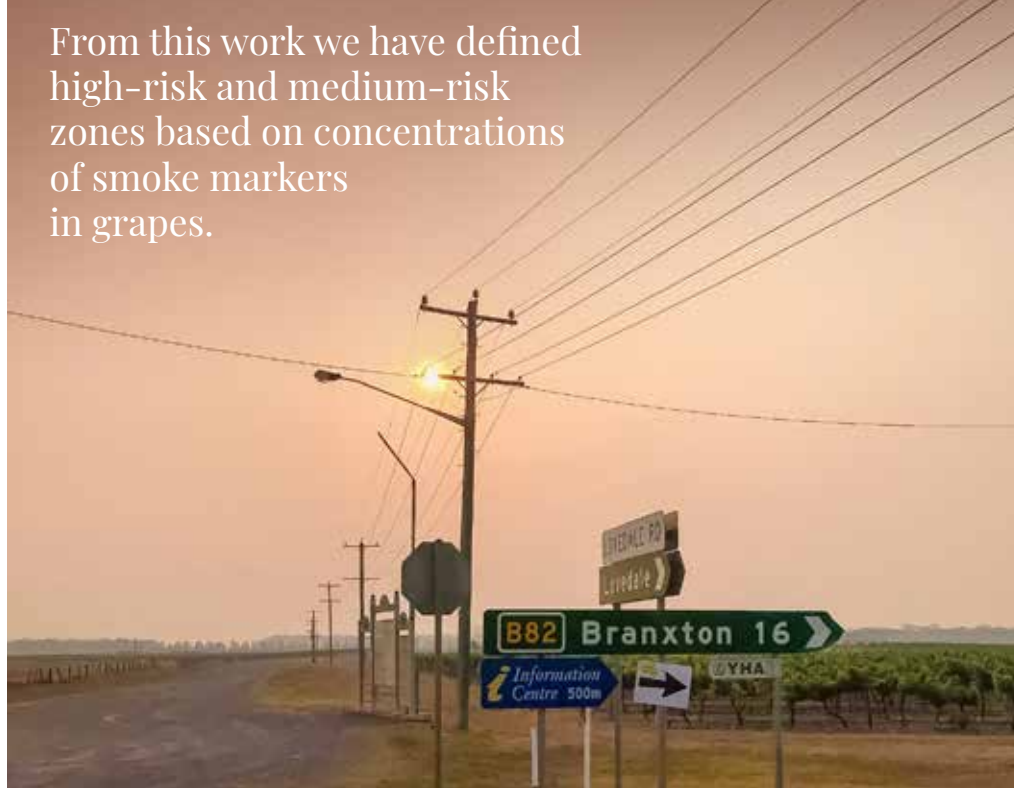
Smoke blanketing Hunter Valley vineyards during the bushfires of late 2019

In 2020, no samples that had been classified as 'clean' according to baseline data produced 'smoky' wines upon thorough investigation by formal sensory assessment. In other words, the comparison of potentially affected samples to baseline values gave no false negatives. Over the years, we have occasionally heard reports of smoky wine being produced from grapes classified as clean by comparing to the baseline,